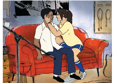
Sweden's sex education film uses animation

Protection: A Film About Men and Condoms in the Time of HIV and AIDS , which is available in seven languages, is aimed at becoming an educational tool for organisations throughout the continent to bring home the realities of HIV and condom use for African men and boys.