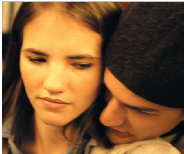
Young adults interpret abstinence in different ways

adults agree penile-vaginal intercourse is sex, less than one in five think oral-genital contact counts as “having sex”.