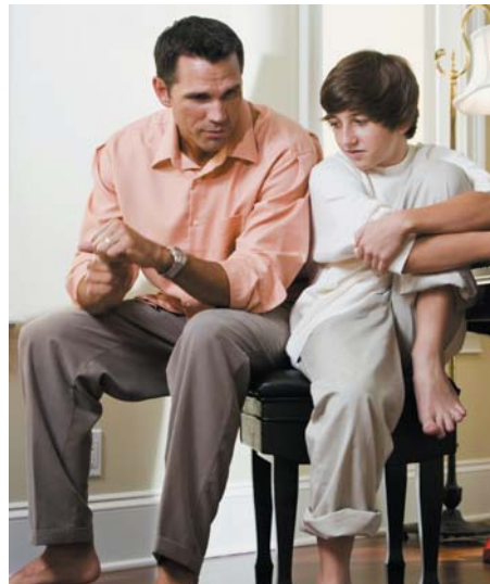
Talking about sex with your children may be uncomfortable, but it pays dividends

On the other hand, the sources that parents thought were the most unreliable